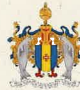
Regional Government of Madeira