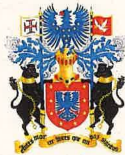
Regional Government of the Azores